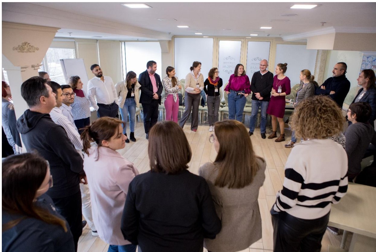
Figure 2. Residential seminar participants at the start of the event.