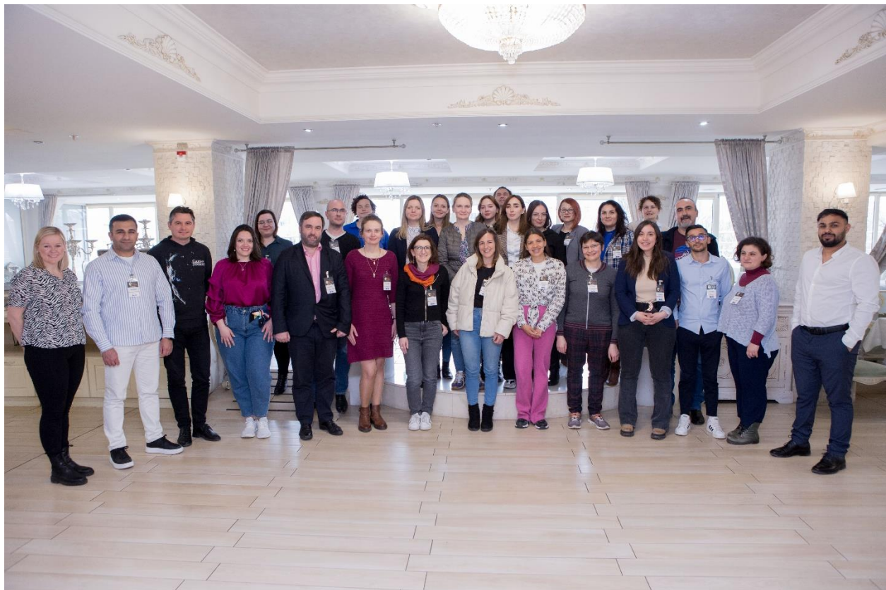
Figure 4. Members of national delegations, the Youth Partnership representatives and mentors.

Given the project is still actively in progress, this report does not provide any summary or conclusions at this time. Rather, it invites the reader to stay tuned as the initiative continues unfolding. For now, we look forward to the delegations and mentors driving towards the project objectives. The story is still being written, so stay tuned!